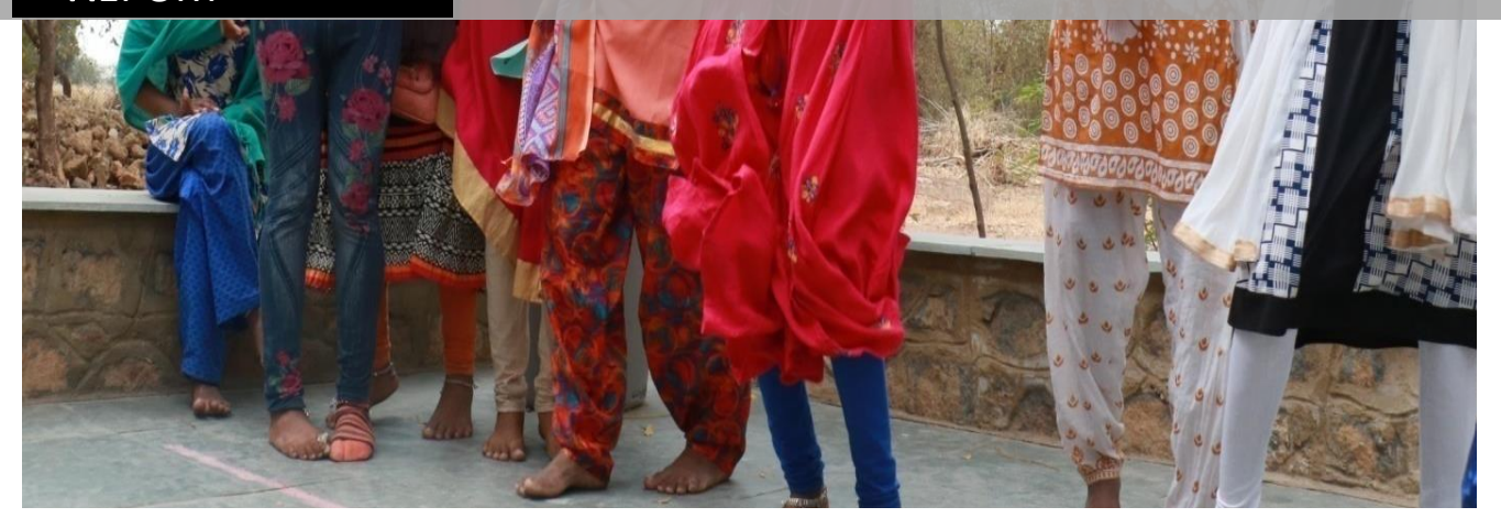
Roundtable conference: Girls and young women- Negotiating agency, choice and consent