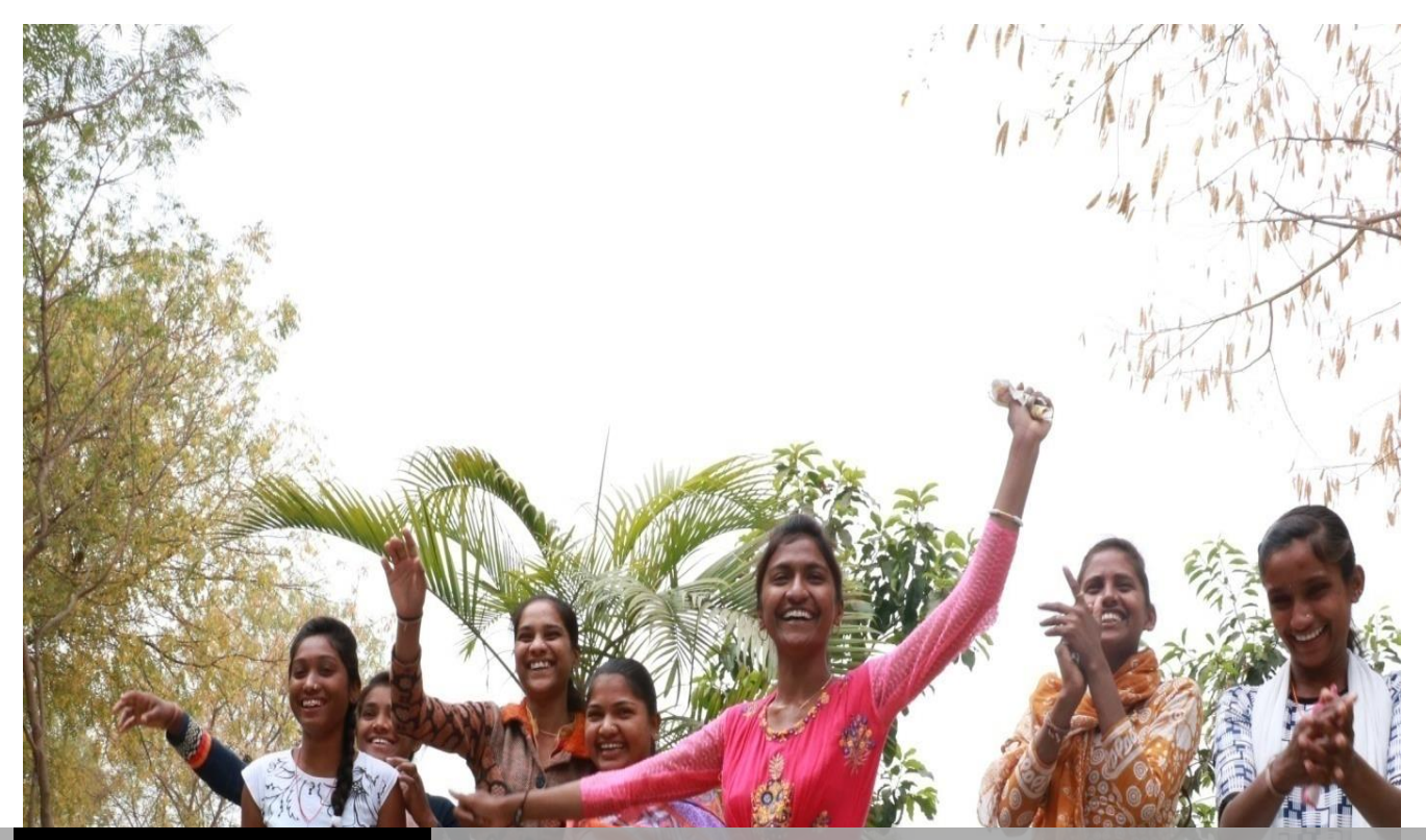
A COMPREHENSIVE REPORT