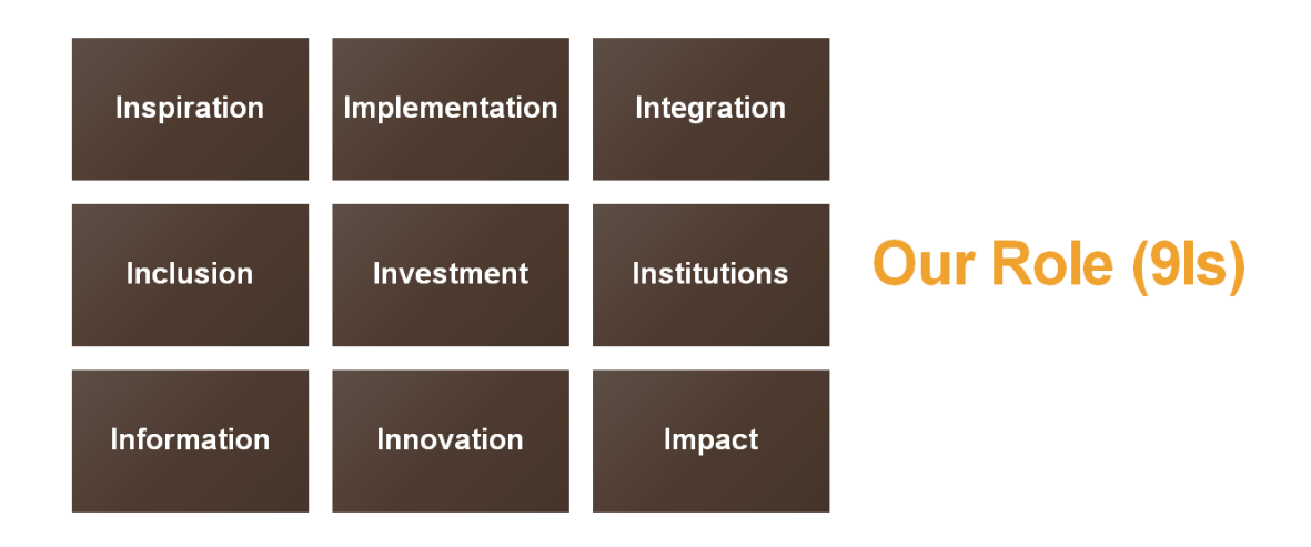
Figure 3

(Note: to access the PPT: https://drive.google.com/file/d/1foHUqzh8Z6yd_L-mWT6EGd3iqr6d9fDs/view?usp=sharing)