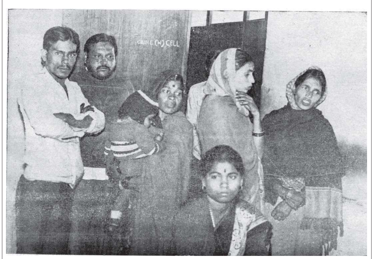
Outside the cell, awaiting their turn

The Cell thus ends up negotiating a deal between two families. The vast majority of women complainants come to the Cell with members of their natal families usually father or brothers. Almost never does a woman come alone. When the husband is summoned, he too almost always comes