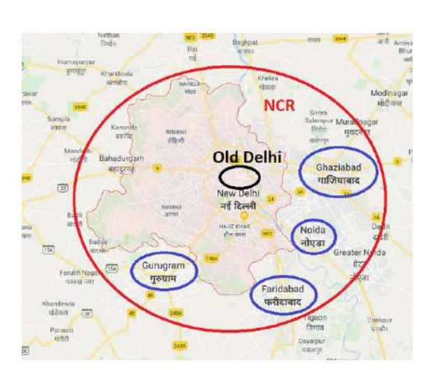
Image2: Primary Research Areas

Since primary research is grounded in the experience of the Act's functioning for a large section of women workers employed in factories and in domestic work, the districts were chosen keeping in mind the prevalence of this particular constituency as well as the distance of the districts from New Delhi, which was the base for the research team. In Delhi the choice of the two districts was based on availability of information and access to LC members.