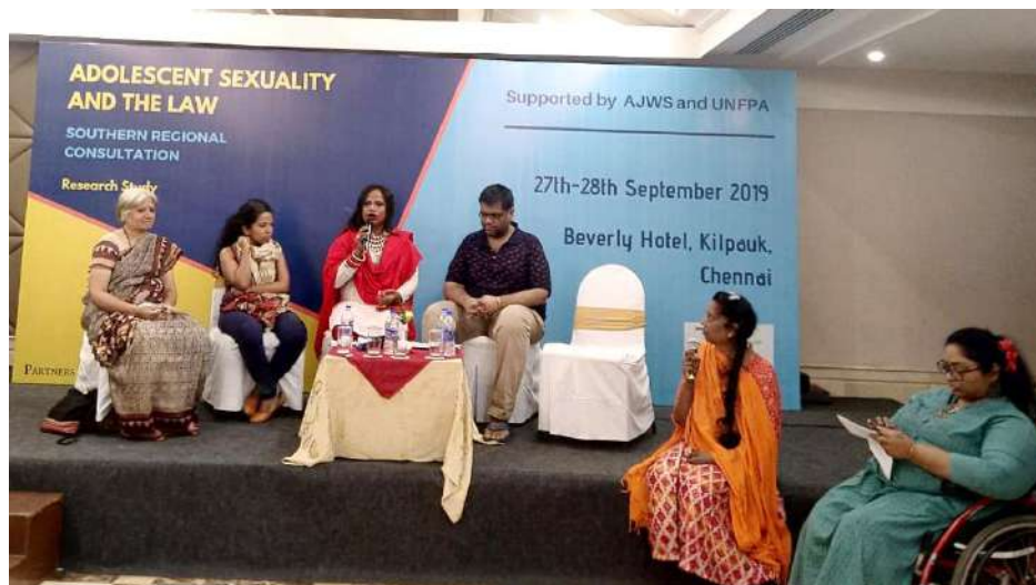
Panelists discussing comprehensive sexuality education