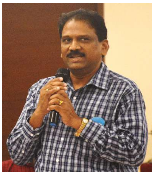
Key takeaways being discussed