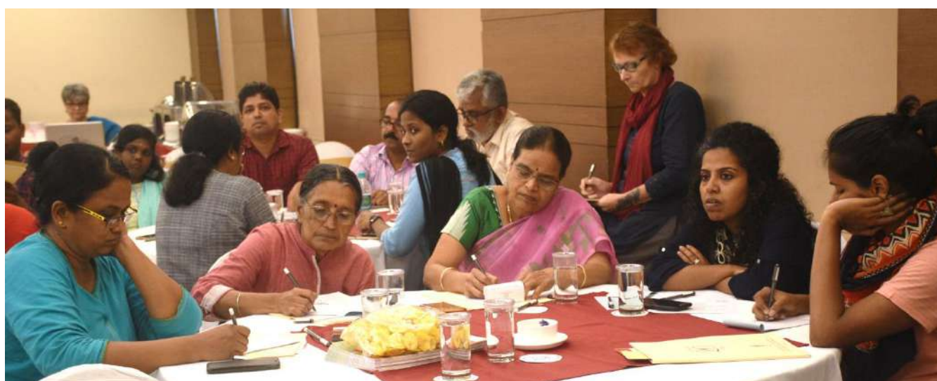
Some participants at the conference

Partners for Law in Development (PLD) in partnership with Tulir organized a two-day consultation to understand and discuss the criminalization of adolescent sexuality. This consultation sought to address in particular the impact of laws and policies on adolescents' sexuality, crisis intervention services, sexual and reproductive health and capacity development. Sixty participants 1 representing individual practitioners as well as about 35 organisations working with adolescents across the domains of healthcare, education, sexuality and law came together to debate and discuss the specific opportunities and challenges presented by legal and state-driven interventions and mandates as well as the methods and avenues they used to navigate these structures.