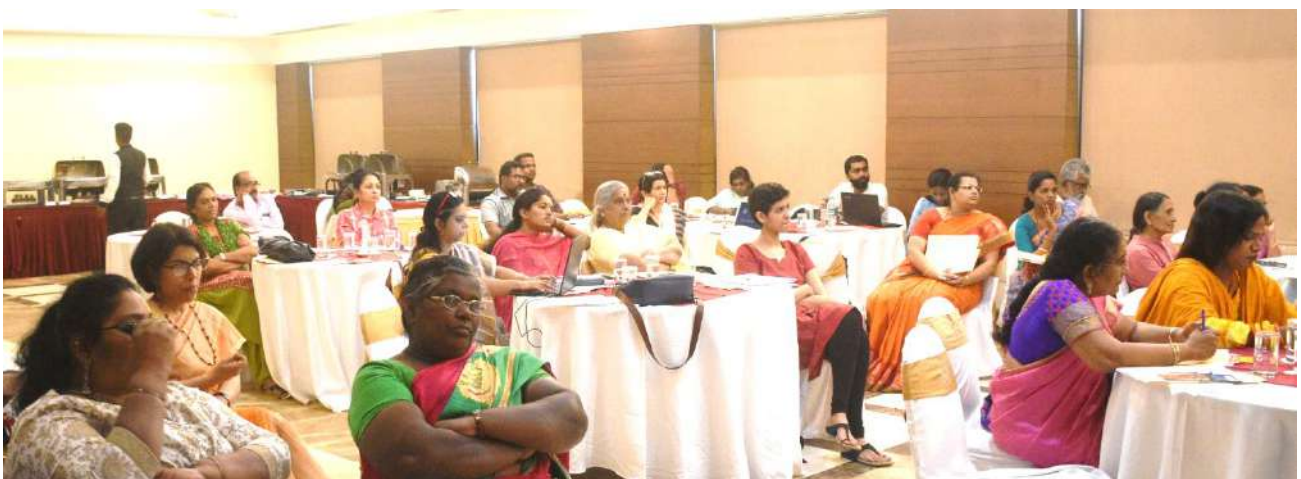
Participants at the conference

It was for this engagement with the complexities and layering of the subject that the consultation was organized, reaching out to professionals working in the sectors of healthcare, child abuse prevention, gender, sexuality education, and LGBTQIA+ issues. Madhu concluded with the hope that such multisectoral conversations will result in multiple perspectives emerging on contexts and challenges of adolescent sexuality.