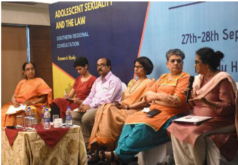
Panelists discussing early and child marriage

school and ministerial authorities, and the school parliament worked together to address the issue of teenage pregnancy amongst girls of 15-16 years. Through awareness programs using street theatre carried out by the students themselves after discussions with the government functionaries, incidents of teenage pregnancy were brought down to zero in the school.