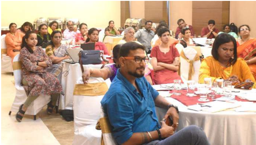
Participants listening to key points at the conference

The two-day consultation ended with participants and organisers alike agreeing to the need for deeper engagement and greater understanding. Participants stressed the need to involve all the stakeholders involved and impacted by the laws governing adolescent sexuality, particularly the medical fraternity and those who work directly on the ground before any uniform stance on topics like the age of consent could be reached. While there was overall agreement on the need to decriminalize consensual sexual activity, the best possible means to achieve this and the repercussions this could have on other laws and issues led to the conclusion that deliberation was better than hasty action. Overall, the two-day consultation reinforced the need for collaborative action and common platforms for knowledge sharing among lawyers, medical professionals, NGO partners, state actors and all other relevant parties to do what is best by our adolescents today.