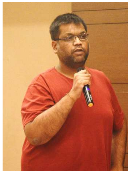
Questions to the panel

The panelists were then asked questions by the audience. One question was how organisations could intervene in the case of a homosexual or asexual youth being forced into heterosexual marriages. Another question pointed to how suicide was seen a response or reaction that girls had in their relationships, and how this played in the communities the panelists worked in.