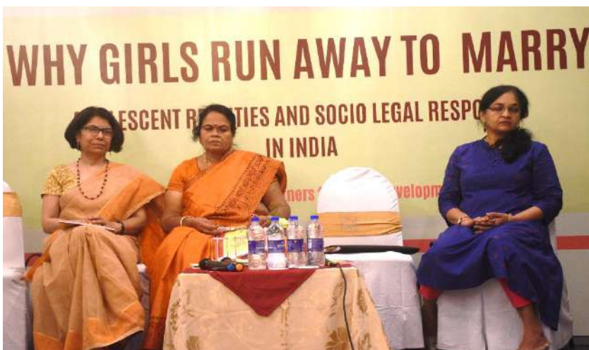
Dignitaries at the report launch

Why are those that are most in need of protection from the law often those worst affected?