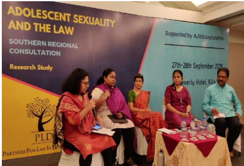
Panelists discussing criminalisation and sexual consent